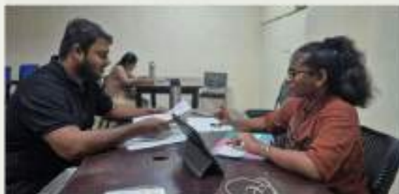
POST TEST REVIEW